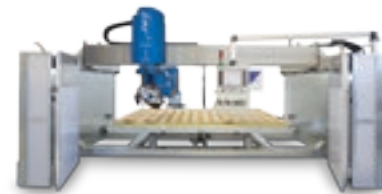
Jet 625 cnc