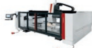
Master 33.3 Plus-38.3 Plus-45.3 Plus