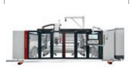
Mastersaw 625 Double Table