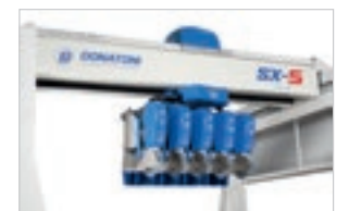
SX-3 / SX-5