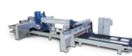
Belt / Twin