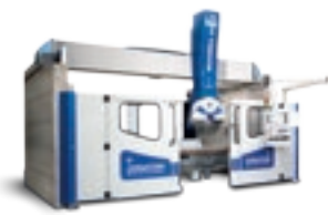
Quadrix DV 1100