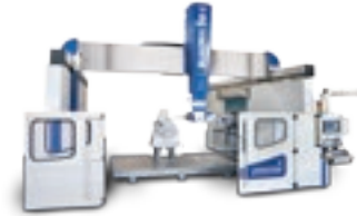
Quadrix DG 1300/1600/2000