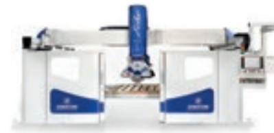
Echo 725 cnc