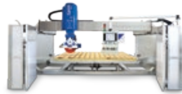
Spin 625 cnc